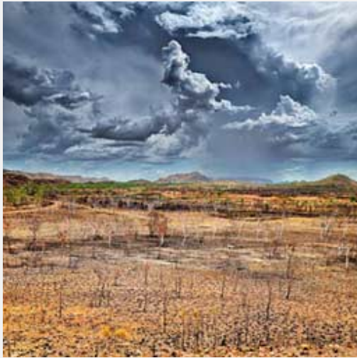
NORTH 1 2015