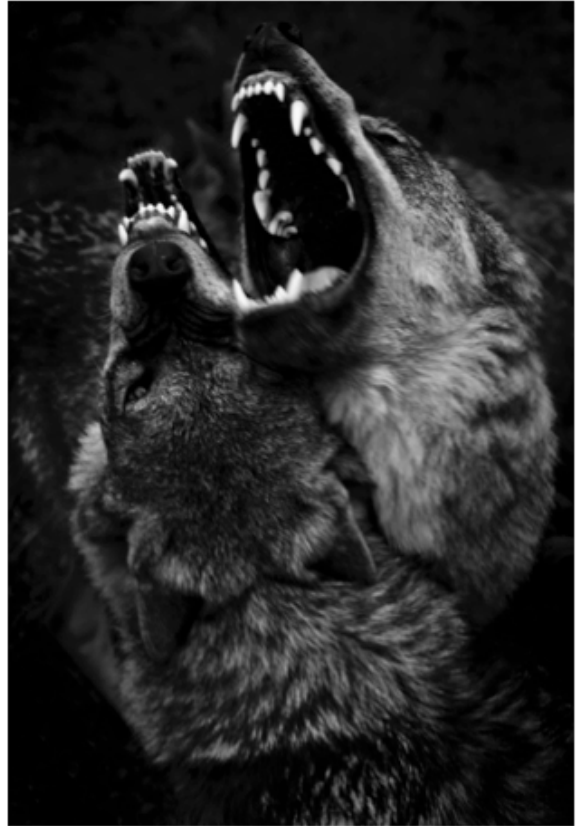
UNTITLED 16 Norway 2012