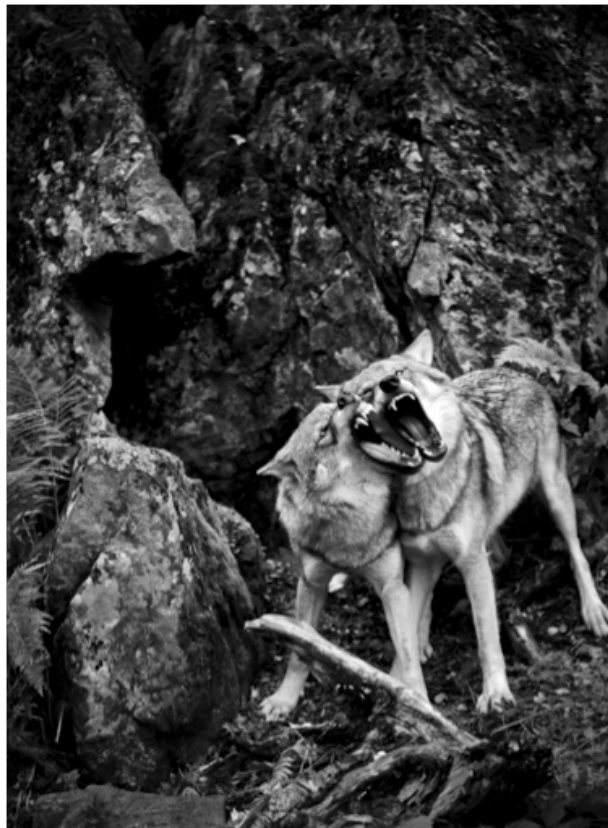
UNTITLED 21 USA 2011