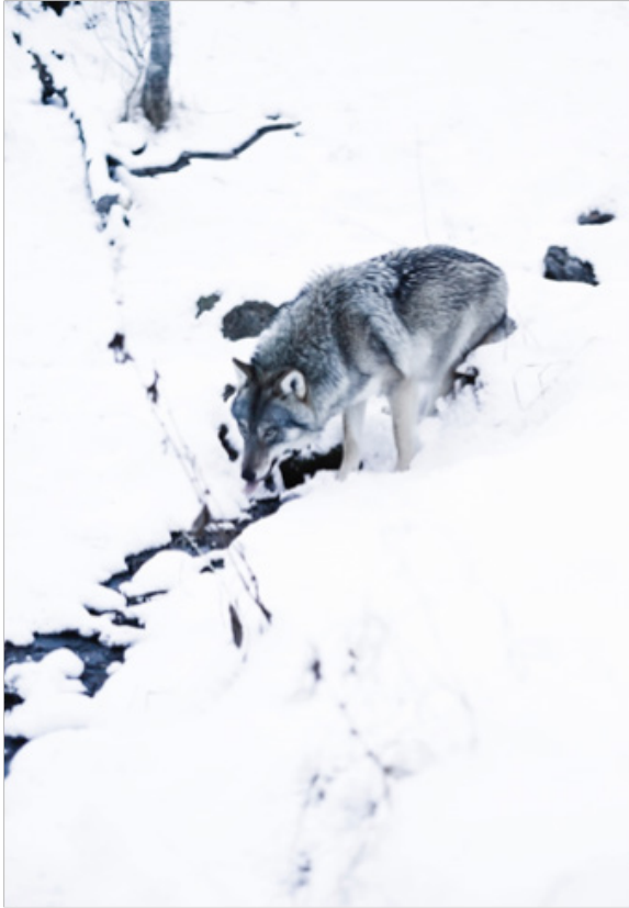
UNTITLED 10 Norway 2012