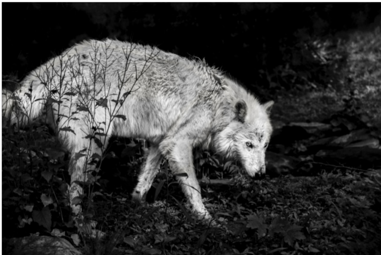
UNTITLED 22 USA 2011