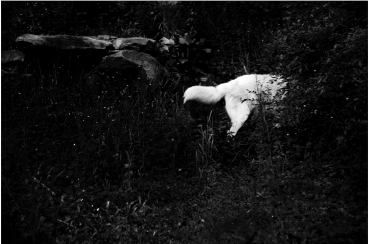
UNTITLED 21 USA 2011