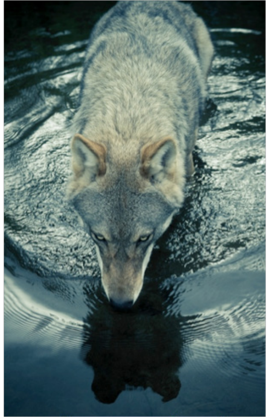
UNTITLED 3 Norway 2011