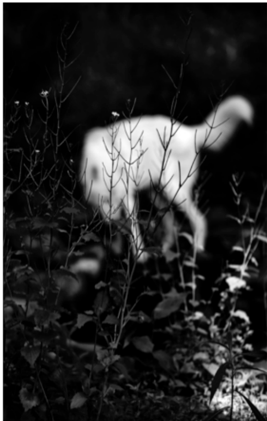
UNTITLED 4 Norway 2012