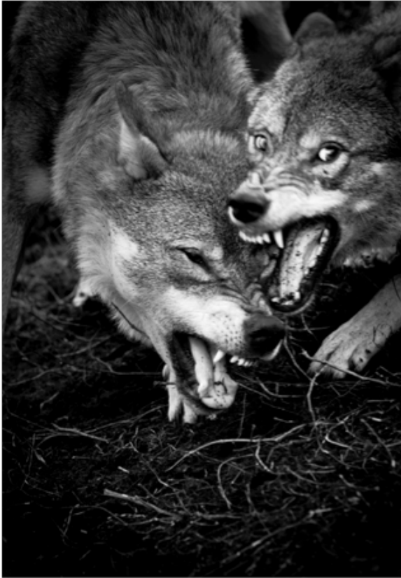
UNTITLED 17 Norway 2012