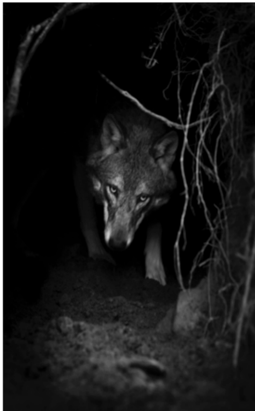
UNTITLED 12 Norway 2010