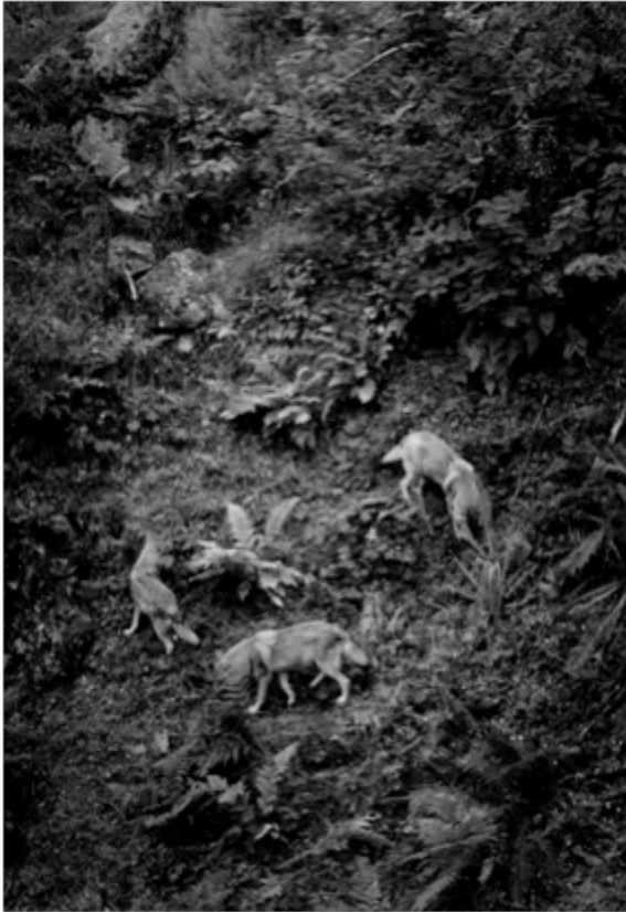
UNTITLED 20 Norway 2010