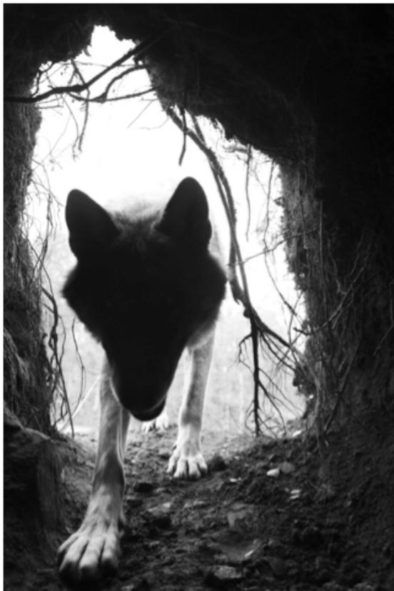
UNTITLED 13 Norway 2012