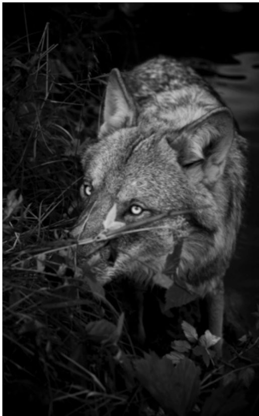
UNTITLED 11 Norway 2011