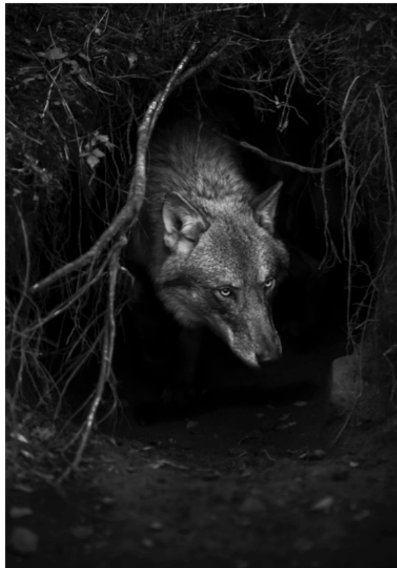
UNTITLED 9 Norway 2012