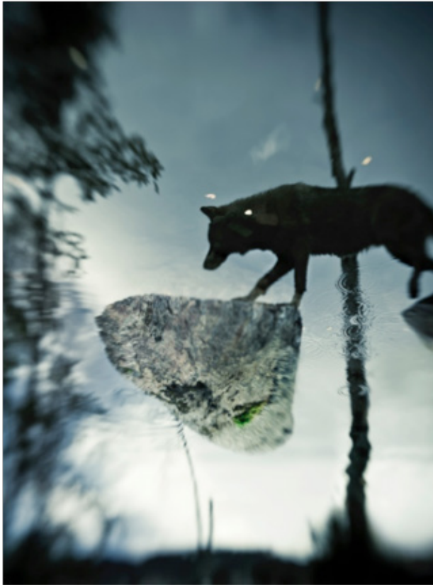
UNTITLED 5 Norway 2010