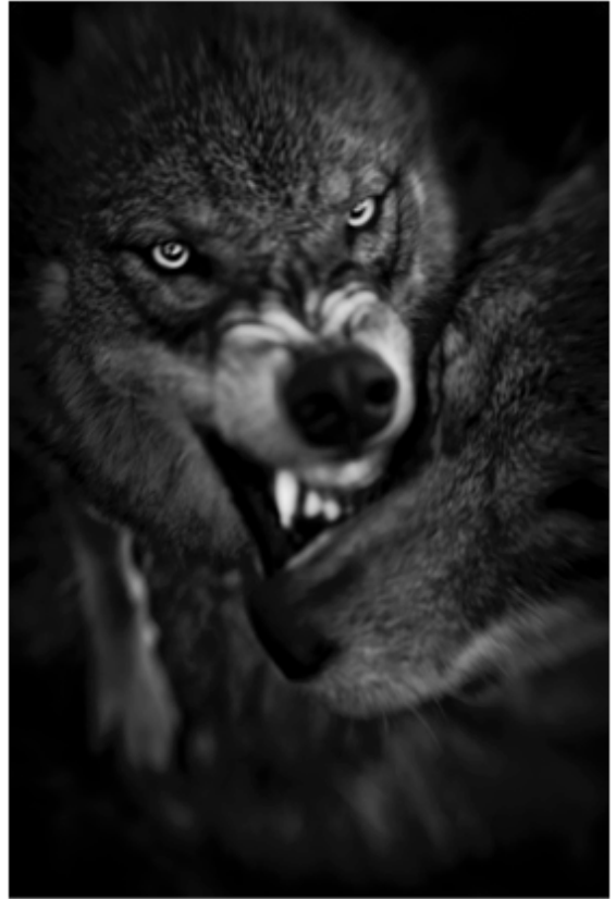
UNTITLED 15 Norway 2011