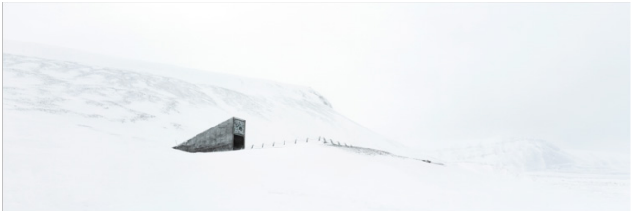
SEEDVAULT 1 Svalbard, 2014