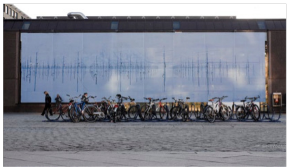
ROM FOR KUNST Oslo City, 2008