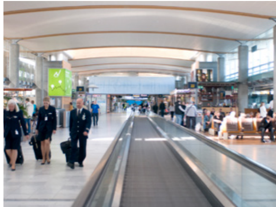
Gardemoen Airport, Oslo