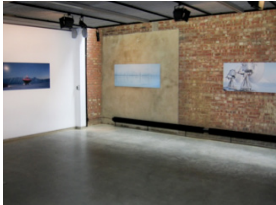
Scout Gallery, London, 2005