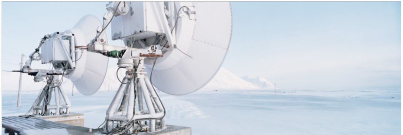
SENTINELS Svalbard, 2002