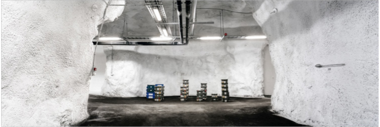
SEEDVAULT 6 Svalbard, 2014