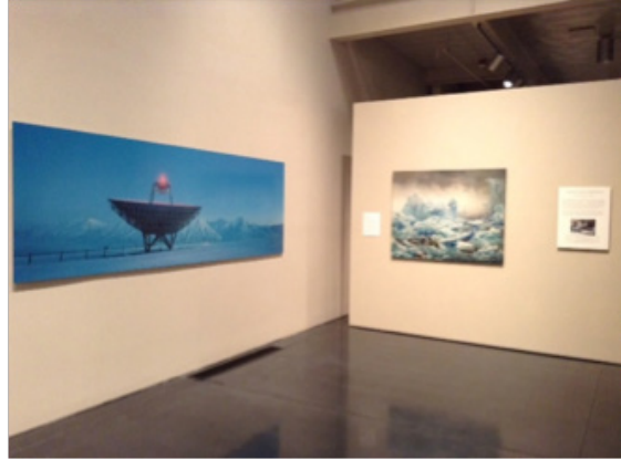
VANISHING ICE Whatcom 2012/2013