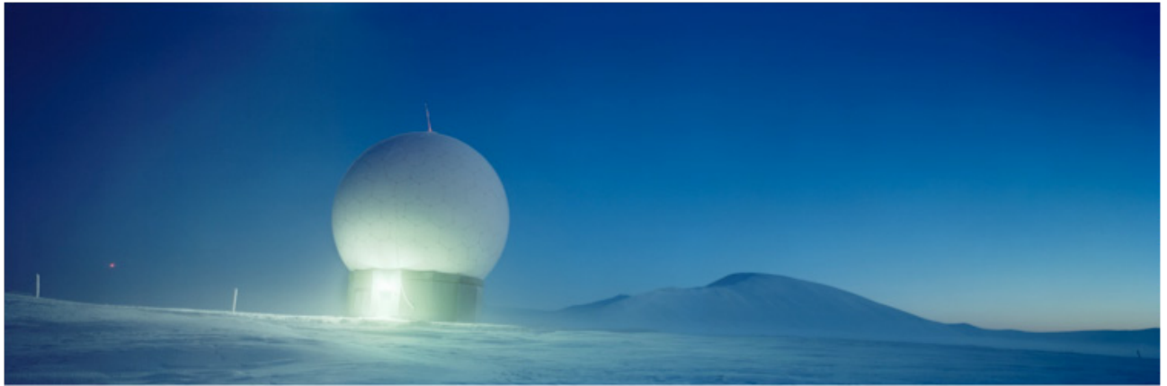
DUSK Svalbard, 2003