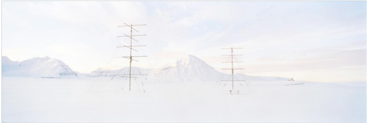
SUNKEN SHIP Svalbard, 2001