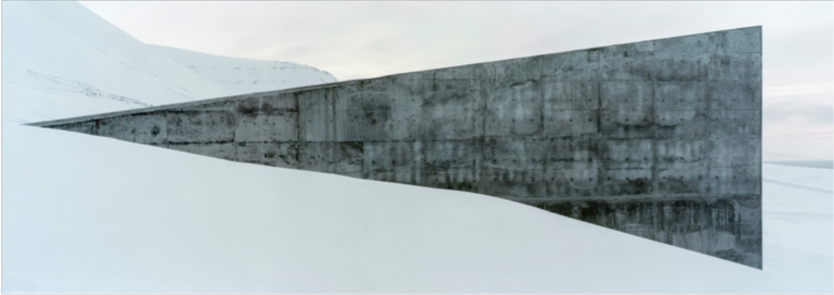
SEEDVAULT 3 Svalbard, 2012