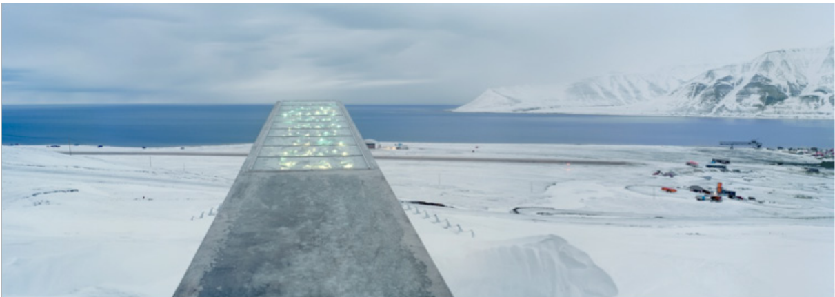
SEEDVAULT 4 Svalbard, 2012