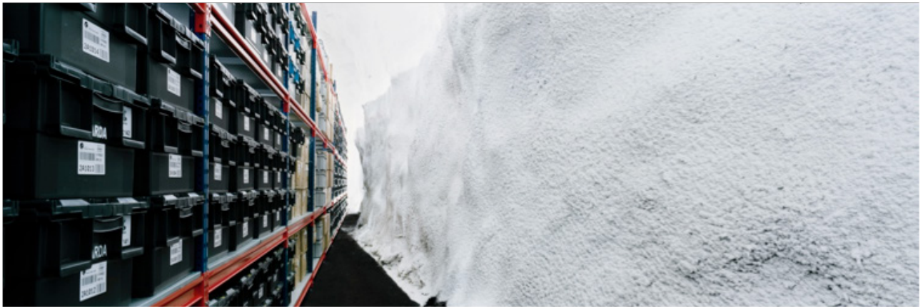
SEEDVAULT 7 Svalbard, 2014