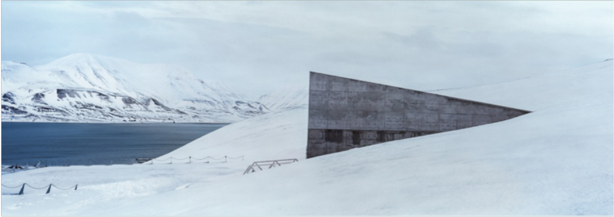
SEEDVAULT 2 Svalbard, 2012