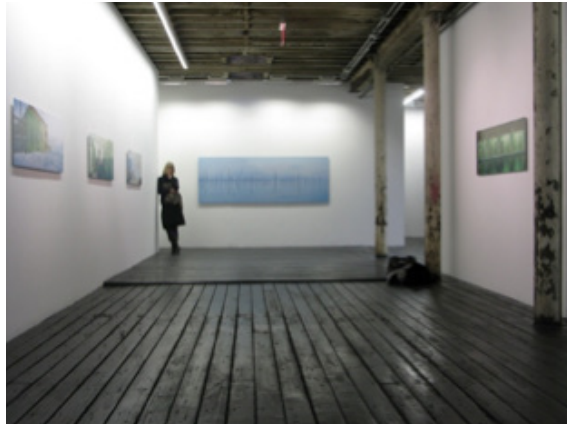
ARCTIC TECHNOLOGY AND BARENTSBURG Hosfelt Gallery, 2006