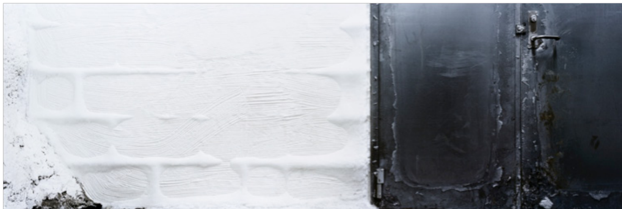
SEEDVAULT 8 Svalbard, 2014