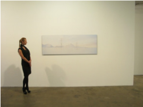
ARCTIC TECHNOLOGY AND BARENTSBURG Hosfelt Gallery, San Francisco, 2009