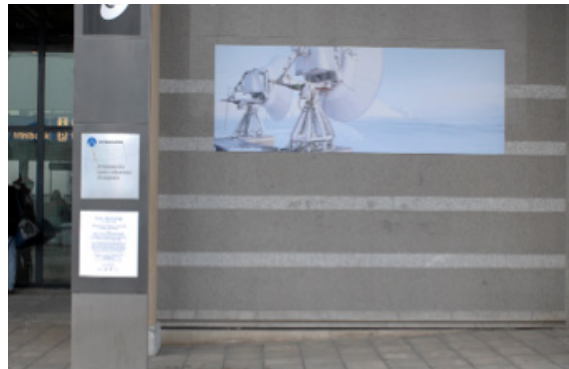
ROM FOR KUNST Tr. Sentral st., 2008