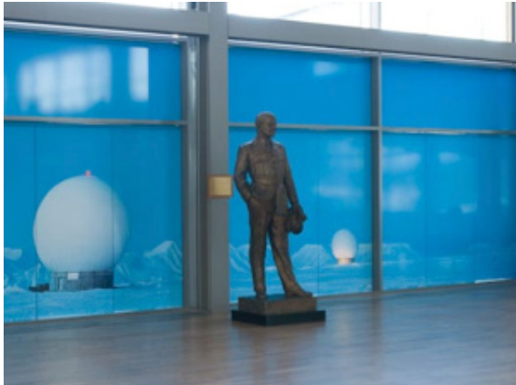
Gardemoen Airport, Oslo