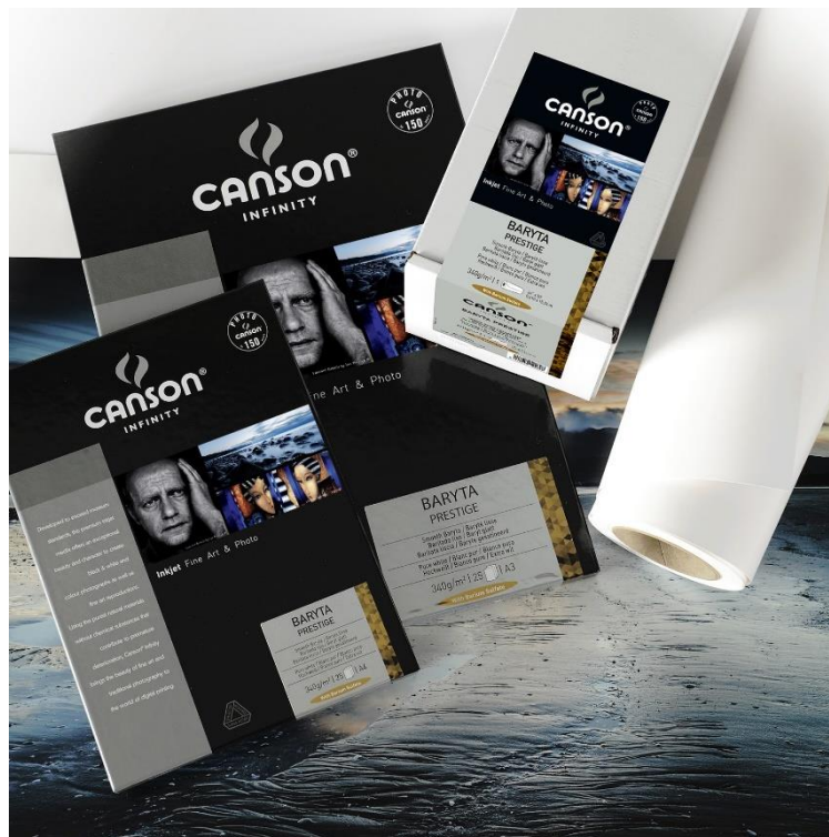
Canson Infinity Baryta Prestige

All artwork presented in the exhibition have been produced on Baryta Prestige paper (340g) by Canson® Infinity. Made of cellulose and cotton without acid, this paper has an excellent durability, as well as a fine and smooth semi-matte texture that grants each print defined details and vibrant colors. With a 100% layer of barium sulfate (Baryta), Canson® Infinity has the features and aesthetics expected from traditional pearl printing paper.